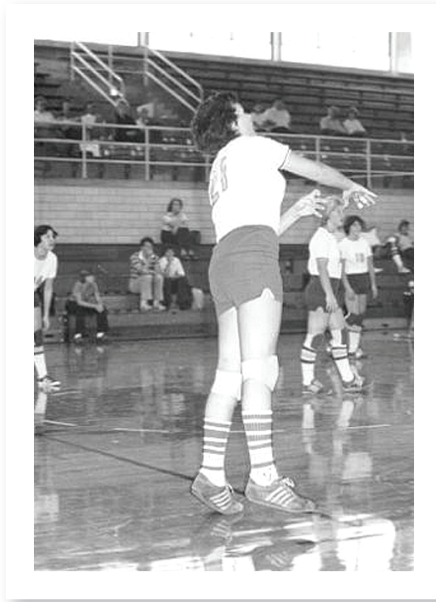
I had an especially wicked serve

I crossed college off of my list—a list that happened to include the Olympics. But with a new life that included a baby, I felt that I had to give up my Olympic dream and tried to set a more realistic goal.